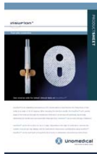
insuflon™ product data sheet

Please be informed that the sales office at Unomedical, Infusion Devices, will be closed for Christmas from Saturday 23 December to Monday 1 January, both days inclusive. During this period, we will not be shipping any orders out of Denmark or Mexico / USA.